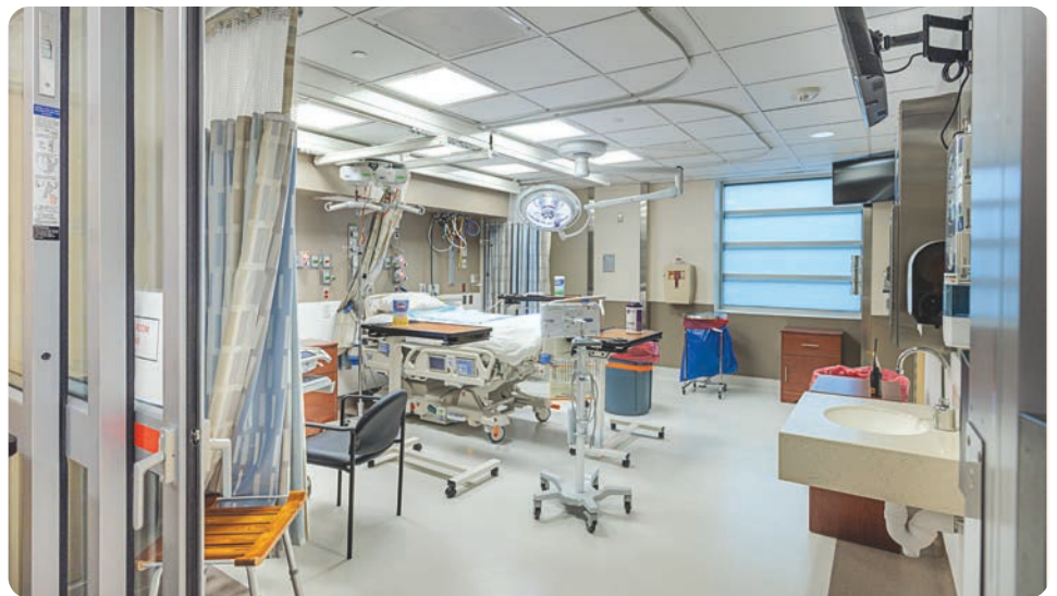
Inside the unit.