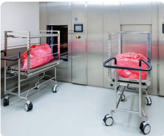
The unit autoclave.