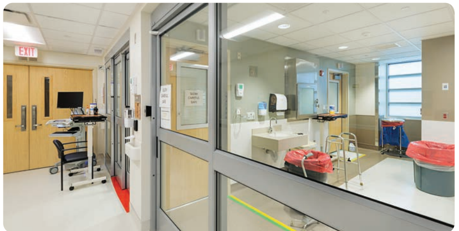
Anteroom where staff will don and doff personal protective equipment.