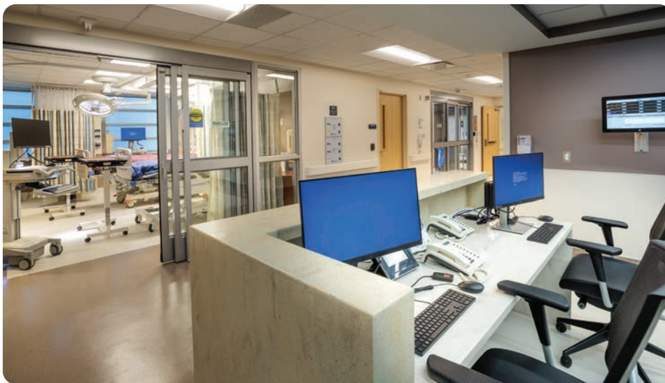
A view of the unit from the nurses station.