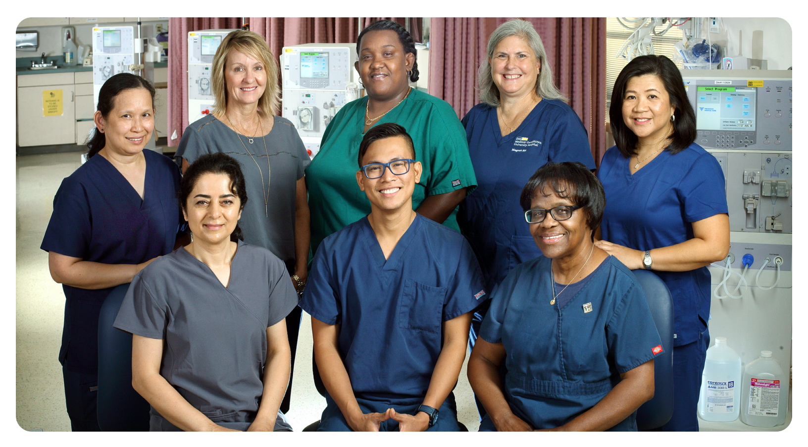
For patients with acute rejection of their transplant, we have available treatments including plasma exchange and maintenance dialysis provided by the inpatient plasmapheresis/dialysis team.