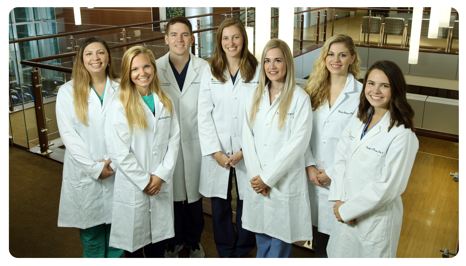
The advanced practice clinicians of the inpatient transplant service.