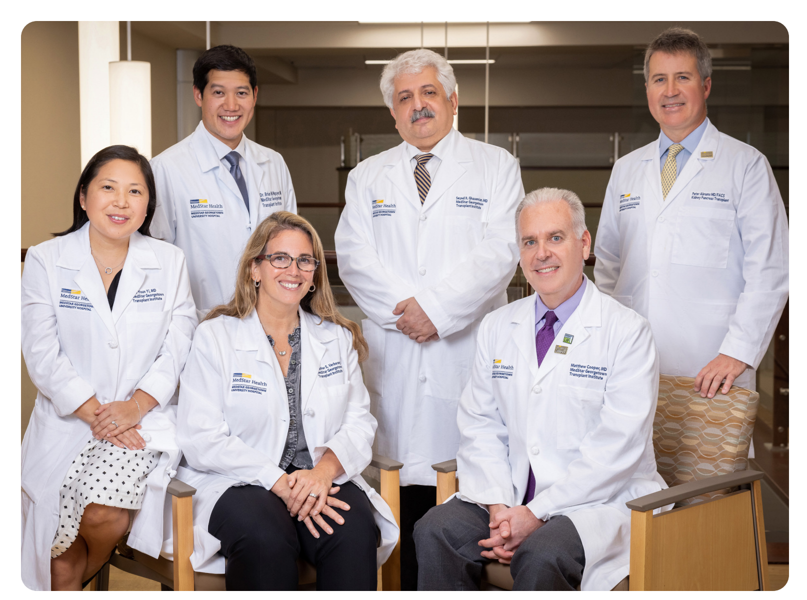
MedStar Georgetown Transplant Institute pancreas/kidney transplant surgical team

If you're a woman of childbearing age, talk with the transplant team about birth control and pregnancy and what precautions you should take before and after your transplant.